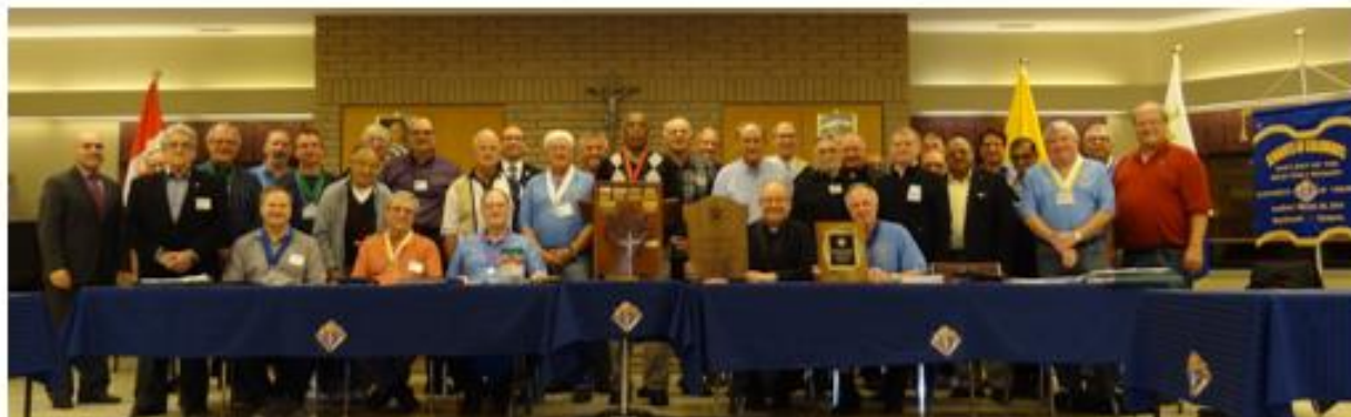
Group Picture of Our Lady of the Most Holy Rosary Council 15920 at the acceptance of Awards received at the 114 th State Convention April 21 -23, 2017 International Plaza Hotel, Toronto, Ontario